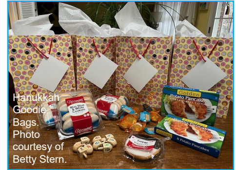
Hanukkah Goodie Bags.