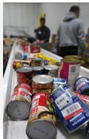
Donated canned goods roll down a conveyer belt to be sorted by volunteers from the U.S. Coast Guard at the Maryland Food Bank in Halethorpe, Md., Feb. 2, 2011.

In the public domain. Wikimedia Commons.