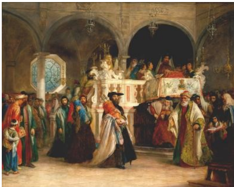
The Feast of the Rejoicing of the Law at the Synagogue in Livorno (Leghorn, Italy) by Solomon Alexander Hart.

Solomon Alexander Hart (1806 – 1881) was a British painter and engraver. He was the first Jewish member of the Royal Academy in London and was probably the most important Jewish artist working in England in the 19th century. — Wikipedia