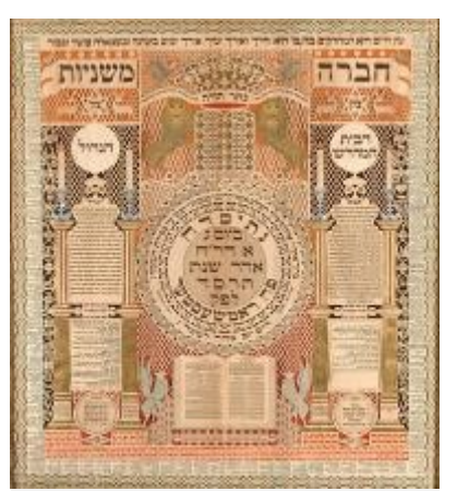
Baruch Zvi Ring - Memorial Tablet and Omer Calendar - Google Art Project.