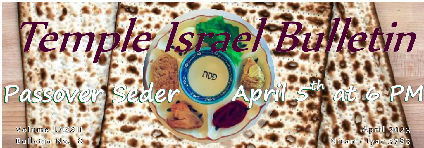
Above: Three matzot. Inset: Pesah plate.