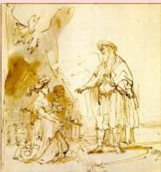
Boaz and Ruth, by Rembrandt

https://commons.wikimedia.org/wiki/File:RembrandtBoasRuth.jpg