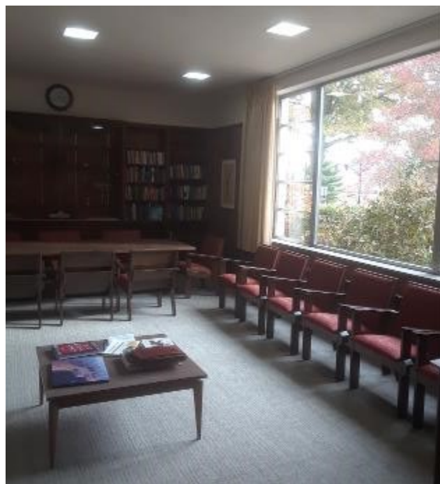
The library refurbished and ready for your reading pleasure—new chairs, carpet and paint. Reference materials have been moved to the Sunday School wing.