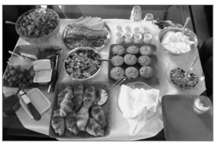
By Katrine Thielke from Copenhagen, Denmark - sveas brunch, CC BY 2.0, https://commons.wikimedia.org/w/index.php?curid=16049653