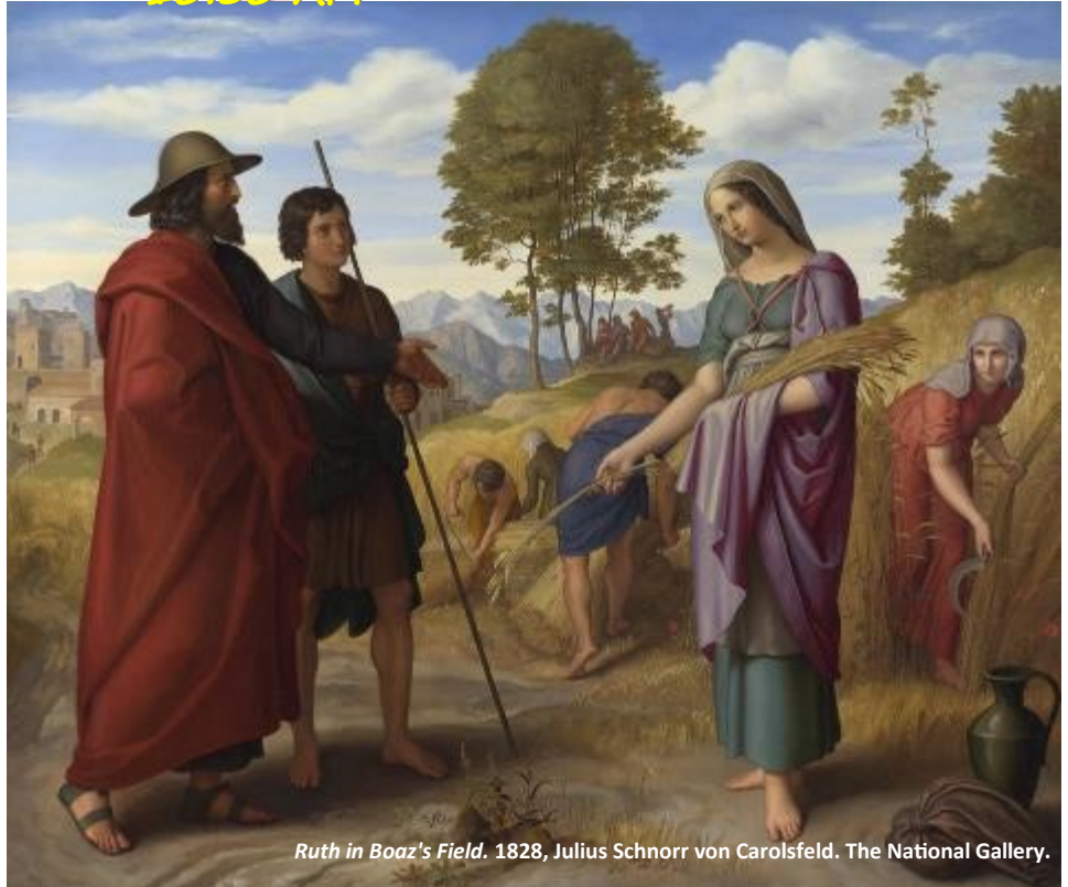
Ruth in Boaz's Field. 1828, Julius Schnorr von Carolsfeld. The National Gallery.

The annual Congregational meeting will be Wednesday, June 12, starting with a social at 5:15 PM, the meeting to begin at 5:45. The board encourages all Temple