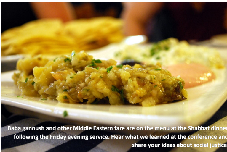
Baba ganoush and other Middle Eastern fare are on the menu at the Shabbat dinner following the Friday evening service. Hear what we learned at the conference and share your ideas about social justice.