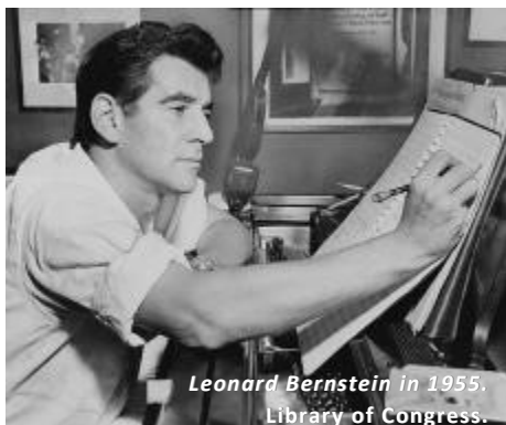
Leonard Bernstein in 1955. Library of Congress.

https://commons.wikimedia.org/wiki/File:Leonard_Bernstein_NYWTS_1955.jpg