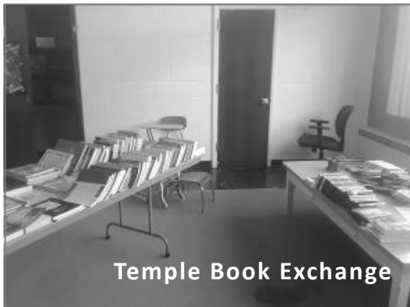
Temple Book Exchange

Monday, Feb. 11, 11:30 AM – 1:30 PM Sisterhood Schmooze