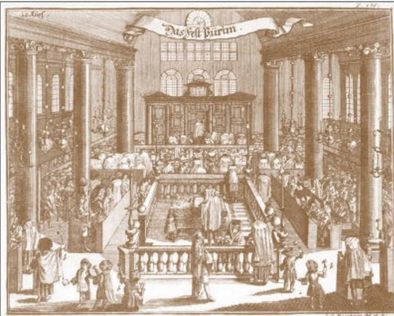
Illustration of a Megillah reading from Juedisches Ceremoniel, a German work. A beautifully illustrated description of Jewish religious ceremonies, rites of passage and feast days, the book first appeared in 1716, here in its second edition of 1724.

Please see front page for info on the Temple's joint Purim event with B'nai Jacob on Feb. 28, to be held at B'nai Jacob Synagogue .