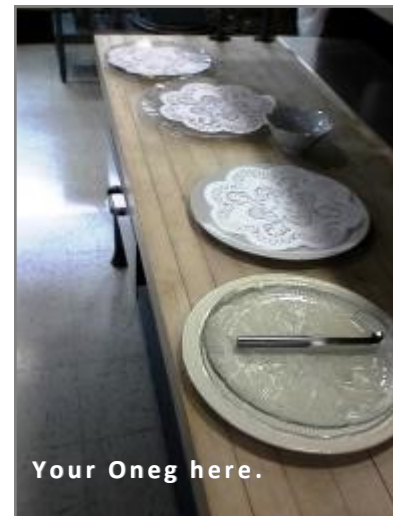
Your Oneg here.

If you would like to sponsor an Oneg, you can choose to shop (items are up to you: some fruit, pastries, cheese and crackers or anything else you would like) to serve about 20 people. Please deliver your food to Mary at the Temple by noon on that Friday. If you prefer that the Oneg Committee do the shopping, please send a $35 check made payable to Temple Israel, and write "Oneg" and your date on the memo line.