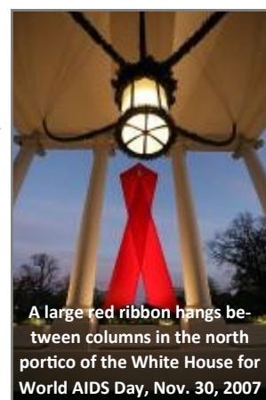
A large red ribbon hangs between columns in the north portico of the White House for World AIDS Day, Nov. 30, 2007